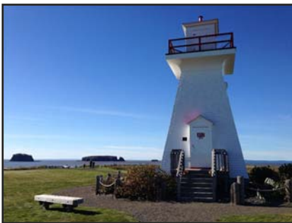
An historic lighthouse, an ocean breeze, a panoramic view, amazing tides, a playship to sail...all this awaits at Five Islands Lighthouse Park.

For directions to these parks and more information, visit www.colchester.ca/parks .