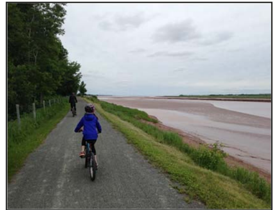
Cobequid Trail, Old Barns

Springtime adventures await you on our terrific trails in Colchester County. With more than 150 km of walking and hiking trails to explore, Colchester County has something for everyone. Walk to your heart's content along the seacoast. Hike to waterfalls in the hills. Run like the wind through the park. Stroll beside wonderful wetlands. Bike beside a beautiful bay. This spring, make trails part of your active, healthy lifestyle! To plan your next trail adventure, visit www.colchester.ca/trails .