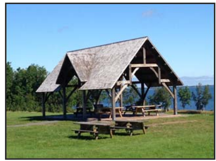
Nelson Memorial Park near Tatamagouche offers a new picnic shelter overlooking the bay, where family and friends can gather.