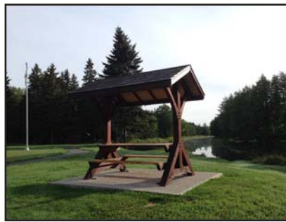
Enjoy a stroll at Stewiacke River Park. Several benches and picnic shelters are situated along the trails and the river, offering relaxing spots to enjoy views of the river and the forest.