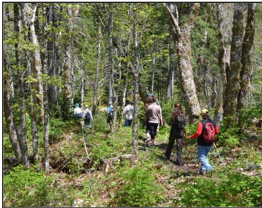
Sandy Cope Trail, Gully Lake Wilderness Area

For more information contact Colchester Recreation at 902-897-3185 or visit www.colchester.ca/spring