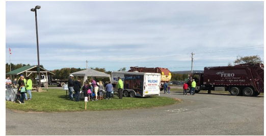
The Touch-a-Truck and barbeque were popular spots at the Open House Event!

On Saturday, October 1 st , we had over 250 residents visit our Solid Waste Facilities in Kemptown. It was a fantastic day full of tours, games, food, fun and great weather. Thank you to each and every one of you who came out to help us celebrate our 20 th Anniversary and learn more about 'Where does it go?' in Colchester. We hope you enjoyed yourselves!