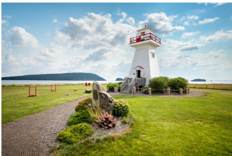
A historic lighthouse, an ocean breeze, a panoramic view, amazing tides, a playship to sail...all this awaits at Five Islands Lighthouse Park.

Regular service resumes at municipal regional parks on May 11, 2019. Experience the spectacular, panoramic view of the Minas Basin at Five Islands Lighthouse Park ; stroll on the shaded paths along the river at Stewiacke River Park ; and ride your bicycle on the Butter Trail through Nelson Memorial Park . These parks feature picnic shelters, a playground, walking paths and washrooms. Visit www.colchester.ca/parks for directions and more information.