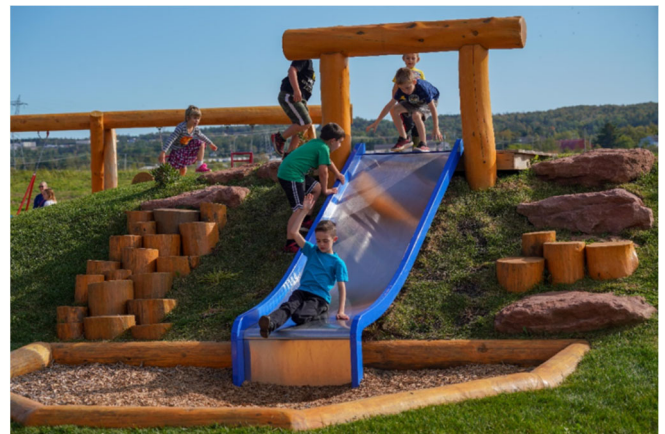
The Fundy Discovery Site playground is a lot of fun - with slides, swings, musical instruments, a sand kitchen and more!

Municipal staff are busy preparing the regional parks for regular operation which resumes on May 9. Why not add a visit to a municipal park to your list of things to do in 2020? Experience the spectacular, panoramic view of the Minas Basin at Five Islands Lighthouse Park . Stroll on the shaded paths along the river at Stewiacke River Park . At the Fundy Discovery Site , watch the tidal bore from the Cobequid Trail and explore the natural playground. At Nelson Memorial Park near Tatamagouche, ride your bicycle on the Butter Trail (part of the Great Trail). These parks feature picnic facilities, a playground, walking paths and washrooms. Visit www.colchester.ca/parks for directions and more information.