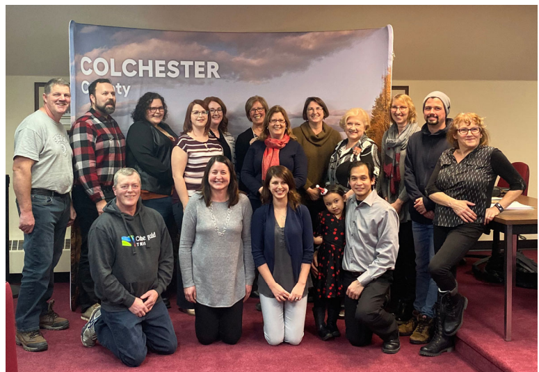
Staff who attended the 2019 Service Recognition Ceremony held in December.