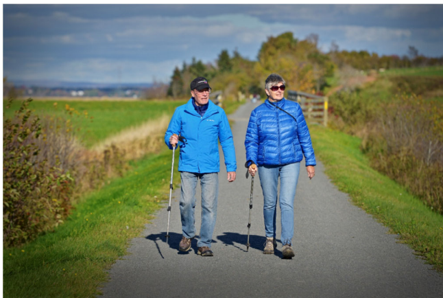
Cobequid Trail – Old Barns

Plan your next trail adventure at www.colchester.ca/trails .