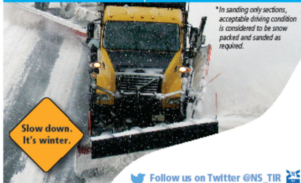
* In sanding only sections, acceptable driving condition is considered to be snow packed and sanded as required.

There are more than 400 snow plows and other snow-clearing vehicles working to keep Nova Scotia's roads, highways, and bridges safe during the winter months. Crews are on the job day and night, 24/7, keeping the roads as safe and as clear as possible. Work starts before the storm and continues during and after the storm. At left is more information to help explain what you can expect this winter.