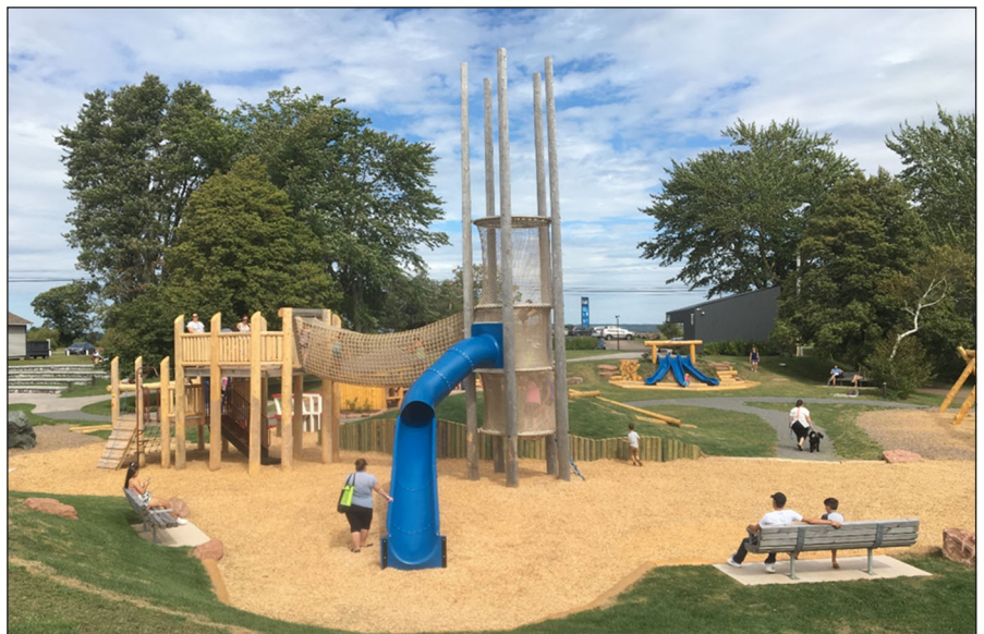
The Fundy Discovery Site playground is a lot of fun - with a climbing tower, slides, swings, musical instruments, sand kitchen and more!

Is visiting a new park on your list of things to do in 2021? Maybe you have a favorite park which you look forward to returning to this spring. Add a municipal park to your list! Experience the spectacular, panoramic view of the Minas Basin at Five Islands Lighthouse Park . Stroll on the shaded paths along the river at Stewiacke River Park . At the Fundy Discovery Site , watch the tidal bore from the Cobequid Trail and explore the natural playground. At Nelson Memorial Park near Tatamagouche, ride your bicycle on the Butter Trail (part of the Great Trail). These parks feature picnic facilities, a playground, walking paths and washrooms. Visit