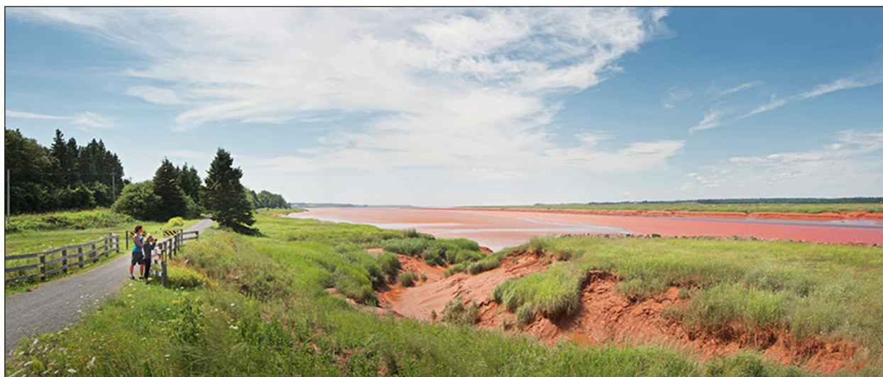
Cobequid Trail – Old Barns

Plan your next trail adventure with family or friends at www.colchester.ca/trails .