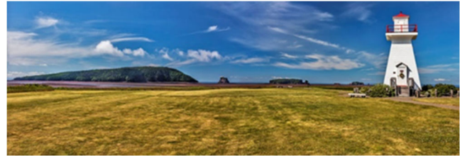
View from Five Islands Lighthouse Park, part of the Cliffs of Fundy UNESCO Global Geopark.

Five Islands Lighthouse Park is a coastal park with a spectacular view of the Five Islands in the Bay of Fundy, home of the world's highest tides. Home to a historic lighthouse (closed until further notice), the park has areas for picnicking, fun and relaxation. Stroll with your family along the beach, or sail away on the ship playground. Take in the panoramic view of the Minas Basin - on a clear day you can see all five islands, the Old Wife (part of Five Islands Provincial Park), the Brothers (Two Islands), Cape Blomidon and Cape Split. Five Islands Lighthouse Park...a view that changes with the tide!