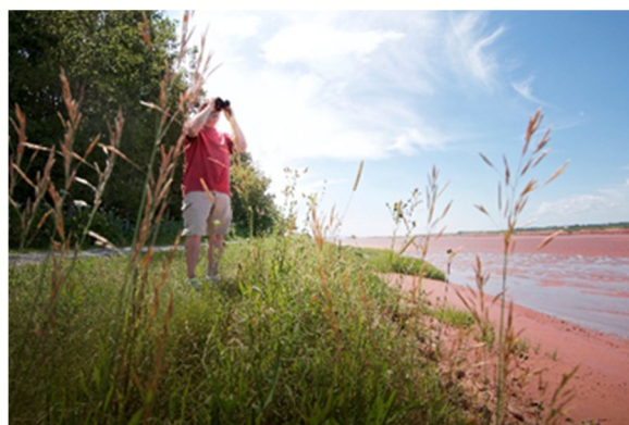
Birdwatching along the Cobequid Trail in Old Barns

Adventures await on the terrific trails in Colchester County. With more than 150 km of walking and cycling trails to explore, our County has something for everyone. Walk to your heart's content along the seacoast. Hike to waterfalls in the hills. Run like the wind through the park. Bike where train whistles used to blow. Stroll beside wonderful wetlands. Relax by the brook or the bay. Explore a new trail this summer! To plan your next trail adventure, visit www.colchester.ca/trails . When enjoying your trail adventures, please follow Public Health guidelines, stay on designated trails, and respect other trail users. Happy Trails!