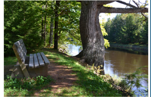
A quiet place to sit and enjoy the river at Stewiacke River Park.

A hidden gem. A quiet, natural area. A beautiful park. These are some words we hear from people visiting Stewiacke River Park. Stroll with family on the walking trails. Sit under old growth pine and hemlock trees. Enjoy views of the river, spring wildflowers, birds and other wildlife. Bring a picnic to share at one of several shelters beside the river. Take the kids to the playground in the heart of the park. This park also features river access. Stewiacke River Park...discover its nature!