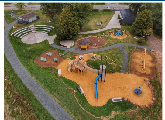
The Fundy Discovery Site playground is inspired by the Bay of Fundy.

Enjoy a picnic and the panoramic view of the tidal Salmon River as it reaches Cobequid Bay. Have fun with the kids at the natural playground. Stretch your legs by walking or cycling the nearby Cobequid Trail. Talk to friendly staff at the Visitor Centre (May to October) to get tidal bore and tide times along with information on area attractions and things to do. Finish your day with a tranquil view and extraordinary sunset. Fundy Discovery Site...be moved by the world's highest tides.