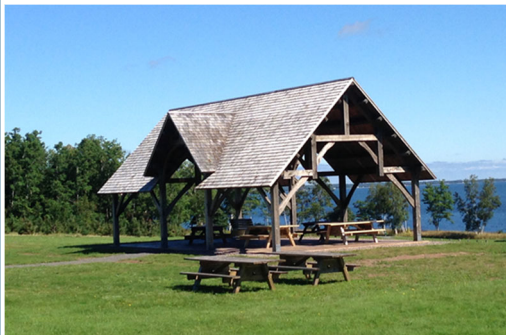
Each of the regional parks has a large picnic shelter, like this one at Nelson Memorial Park.

Situated beside Tatamagouche Bay, this park is a great place to spend an afternoon. Explore the