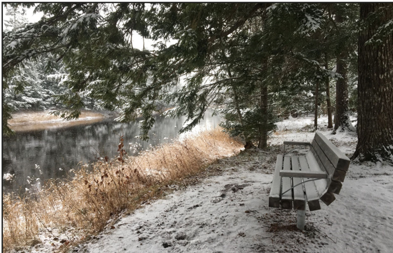
A bench beside the river at Stewiacke River Park, which is available for walking year-round