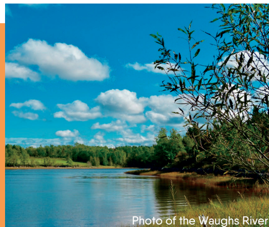
Photo of the Waughs River