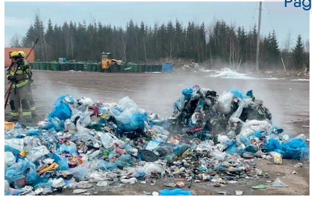
Battery Fire at the Materials Recovery Facility on January 30, 2023

To find the nearest battery drop off site near you, contact the Colchester Helpline at (902) 895-4777.